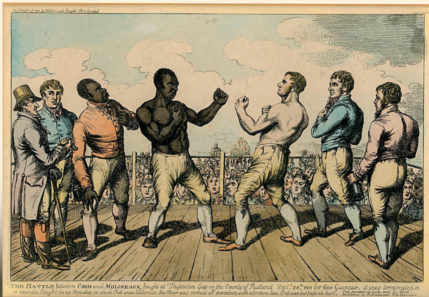
'THE BATTLE BETWEEN CRIB AND MOLINEAUX', 1811: This widely reproduced contemporary illustration of the second world-title fight shows Tom Molineaux and Tom Cribb, the English Champion.

THE SLAVE WHO FOUGHT HIS WAY TO FREEDOM AN SCLÁBHAÍ A THROID CHUN AN tSAOIRSE A BHAINT AMACH